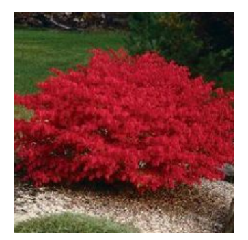
Turkestan Burning Bush